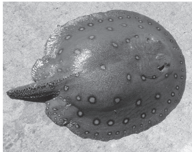
Figure 2 - Pregnant female of Potamotrygon motoro with total disc width of 52 cm and total weight of 4 kg captured at the Nuevo Berlín harbor, Río Negro Department, Uruguay, shore of the Uruguay River ( \sim 32^{\circ} 58' 60''\text{S} and 58^{\circ} 2' 60''\text{W} ) on February 28 th , 2009, with hook and reel.