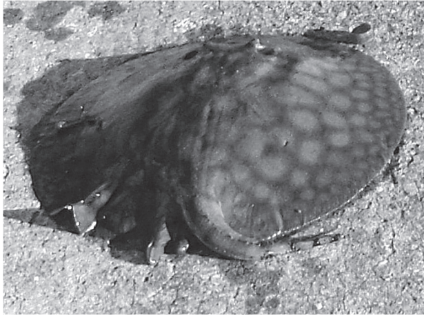
Figure 3 - Subadult male of Potamotrygon brachyura with total disc width of 42 cm and total weight of 3 kg captured at the Nuevo Berlín harbor, Río Negro Department, Uruguay, shore of the Uruguay River (~32° 58' 60"S and 58° 2' 60"W) on February 28th, 2009, with hook and reel.

by the fishermen as no scale was available at the time. Sex and maturity stage (assessed by external characteristics) were inferred through the photographs, sensu Castex (1963), Castex and Maciel (1965) and Achenbach and Achenbach (1976). Specimens were returned alive to the stream, for this reason further biological sampling did not take place.