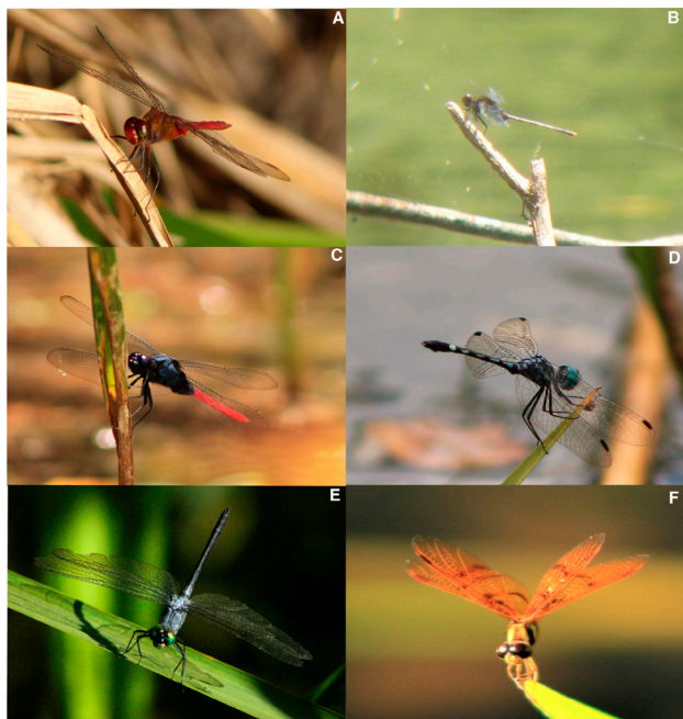
Figure 2. Anisoptera species recorded along transects on the shores of Cocha Cashu (Manu National Park, Peru) during October and November 2017. A – Brachymesia furcata ; B – Erythemis plebeja ; C – Erythemis peruviana ; D – Micrathyria/Nephepeltia ; E – Oligoclada pachystigma ; F – Perithemis lais . This figure is in color in the electronic version.

As in my results, the Anisoptera B. furcata and E. peruviana were found to prefer herbaceous areas of a lake in Brazil (De Marco et al. 2005). Perithemis lais was reported to avoid open areas (Calvão et al. 2003) and their similar abundance in herbs and shrubs in my survey could be owed to the presence of the substrate where they roost (branches; Garrison et al. 2006) in herbaceous areas. Similarly, O. pachystigma was reported